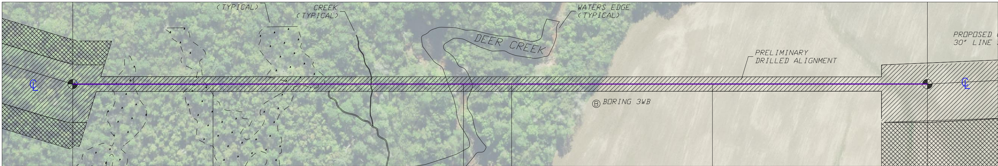
OVERALL PLAN VIEW