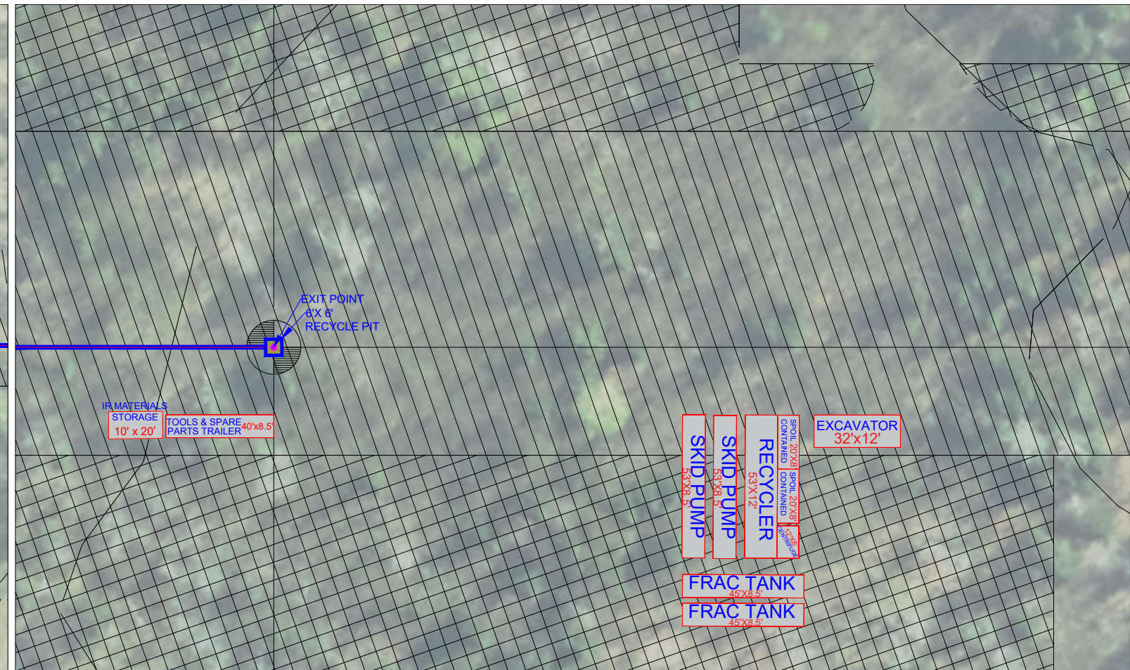
PLAN SCALE: 1"=50'