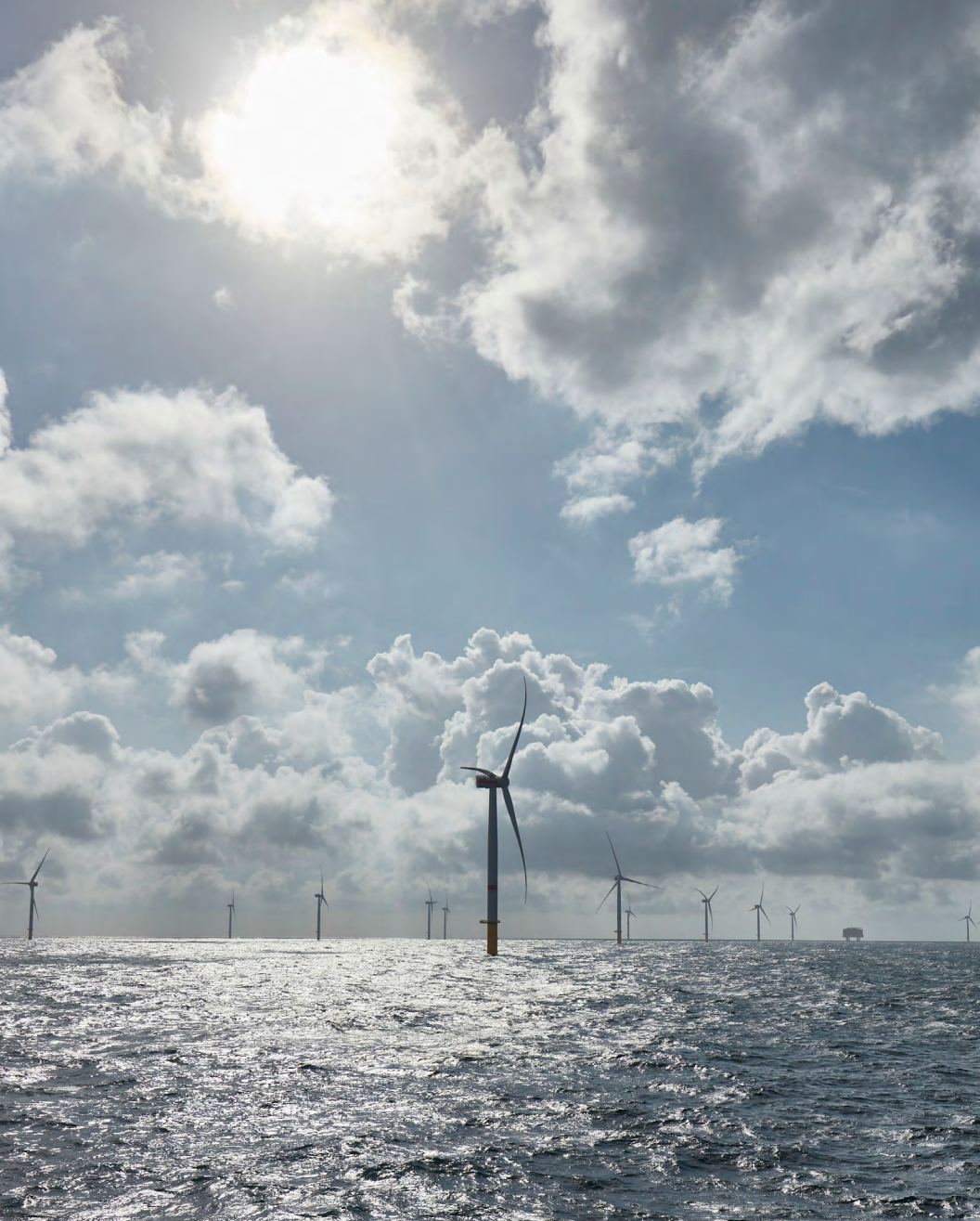
> The 497-MW Hohe See Offshore Wind Project, in the North Sea off the coast of Emden, Germany.

Enbridge has committed to the energy transition by extending and modernizing our systems, growing our renewable power business, advancing clean energy projects like hydrogen and renewable natural gas, and investing in new technologies.