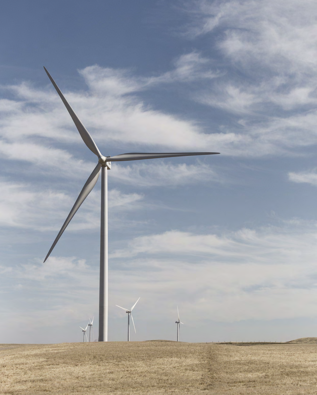
> The 300-MW Blackspring Ridge Wind Farm, located in Alberta, Canada, is one of the largest wind projects in the country.

At Enbridge, we exist to help fuel the quality of life for millions of people across North America.