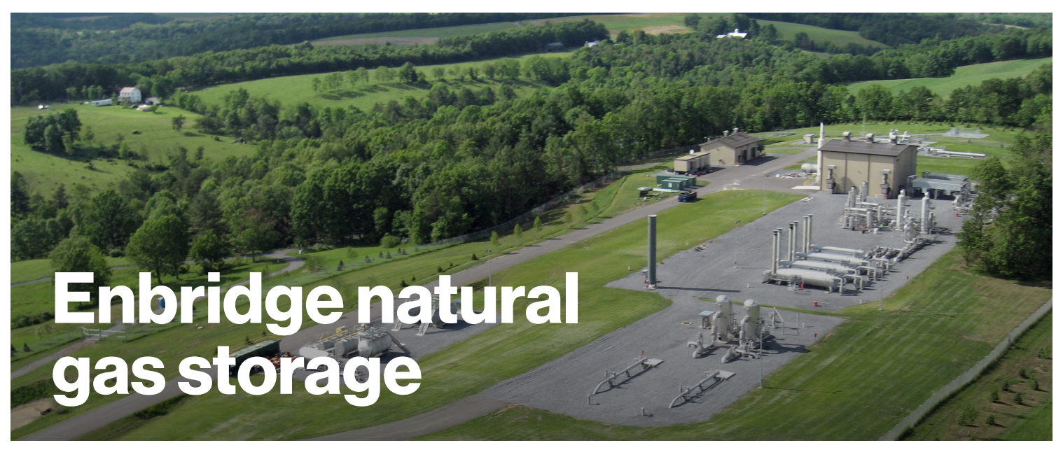
> Steckman Ridge Storage Facility, Bedford County, Pennsylvania

Enbridge owns or operates nine natural gas storage facilities in the United States (U.S.) and 36 natural gas storage fields at the Dawn Hub storage facility in Ontario, Canada, in addition to other Canadian facilities in Ontario and British Columbia, with a net working storage of 622 billion cubic feet (Bcf) across North America.